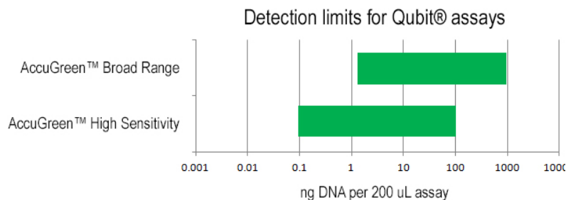
Figure 2. Chart comparing the linear detection ranges for each dsDNA Quantitation Kit for use with the Qubit® reader. The units are ng of dsDNA per 200 uL reaction. Shown in log scale.